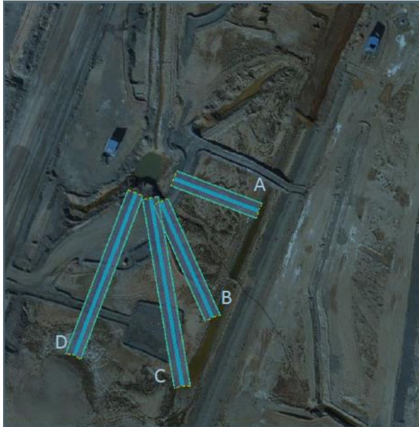
Figure 2: Radial drain trench design and plan view

Additional monitoring boreholes have been drilled and installed in the downstream area of the tailings embankment to improve monitoring. These boreholes are located at varying distances along the alluvial channel.